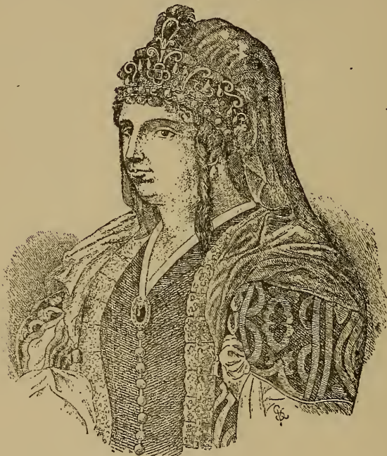
• Կատարինէ Գոռնարոյ Վերջին անուանեալ Թագուհի Հայոց •

robes of white, according to the custom of Armenia, with an open crown upon his head and a golden sceptre in his hand. He lay in state upon an open bier hung